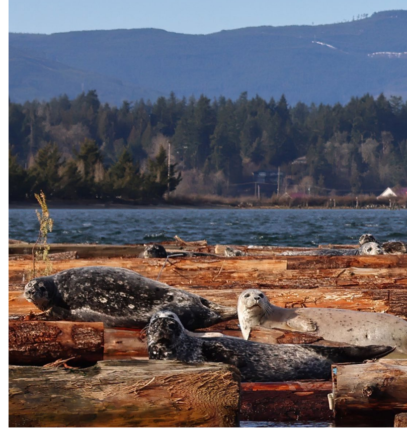
Harbour seals resting on log booms. Are these artificial platforms helping seals hunt for salmon?

As the seal population has grown in the Salish Sea, so has their use of log booms as haul-outs. Seals favour hunting in areas with abundant prey that are in close proximity to their haul-outs, and log booms are often located right where juvenile and adult salmon aggregate during their migrations. Furthermore, because the rafts of logs float up and down with the tides, seals are never forced off at high tide – when salmon are moving into the river mouths during adult migrations. Therefore log booms provide refuge for the seals and their pups from predators and during prime hunting times when their natural rocky haulouts would become submerged. In addition, juvenile and adult salmon often seek refuge under these structures. While the impact of log boom presence on salmon has not been well studied, this line of evidence has led experts to suspect that log booms have facilitated seal predation on salmon.