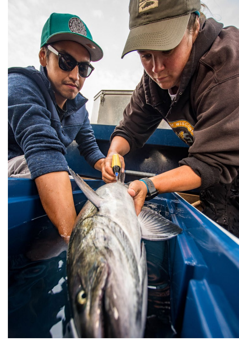
Inserting a PIT tag into an adult Chinook in Cowichan Bay. With the tag in place, migration of this fish was tracked to see whether it survived its time in the estuary and made its way up the river.

Continued research into the impacts of anthropogenic activities on the survival and behaviour of Chinook stocks will support evidence-based management suggestions to increase survival and help to regrow declining populations. This study is set to continue for an additional year, and will use acoustic tags for a third year, enabling model refinements and higher precision for survival estimates and the impact of environmental and anthropogenic effects. Parameters will be expanded to include river temperature.